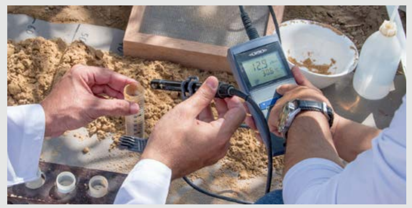
Environment Agency - Abu Dhabi issued resolution on assessment and management of risks resulting from soil contamination in the emirate