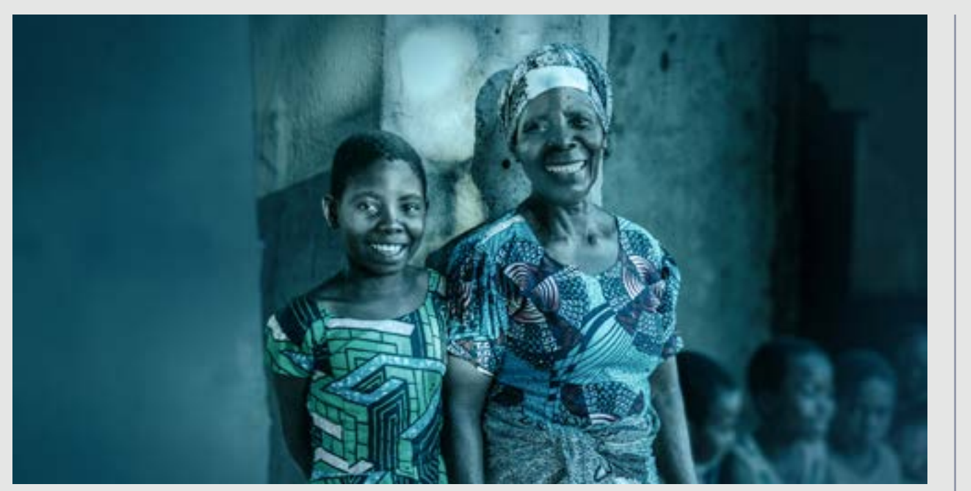
Zayed Sustainability Prize supported solar energy solutions in rural African communities