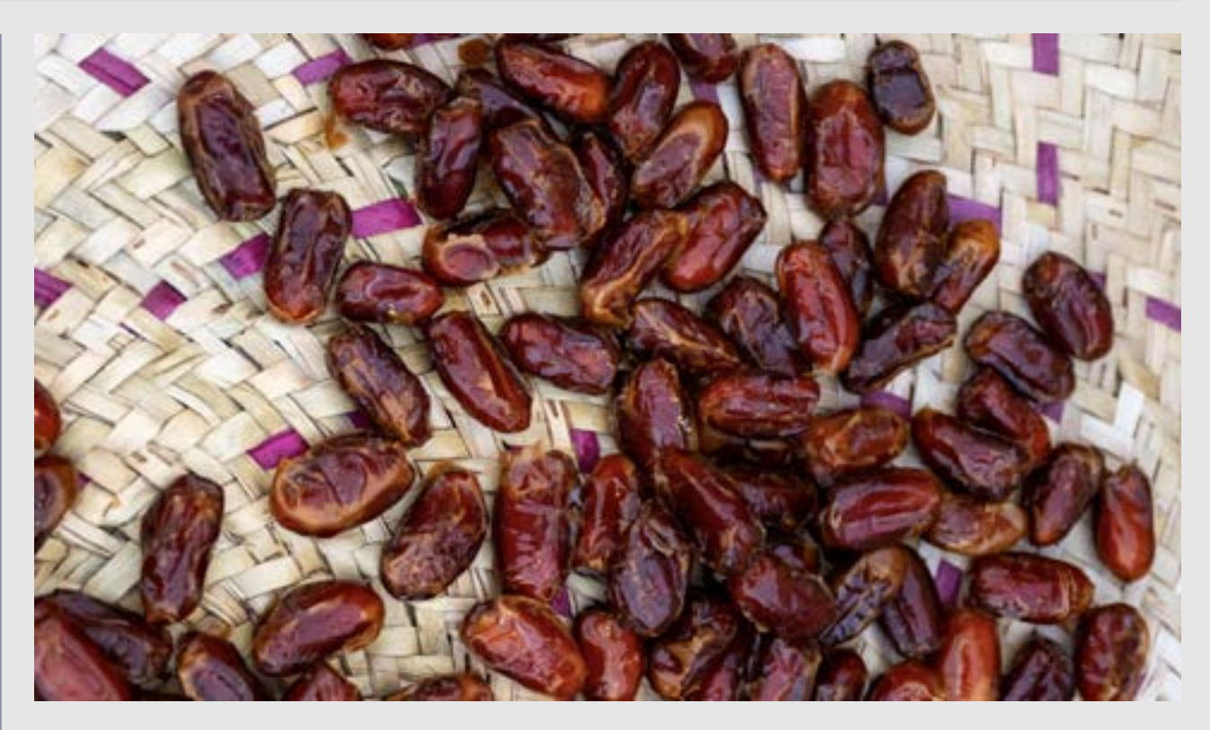
Inaugural Al Ain Date Festival celebrated the quality and variety of UAE dates

Abu Dhabi Department of Economic Development launched Abu Dhabi Registration and Licensing Authority (ADRA) to develop and regulate business sector