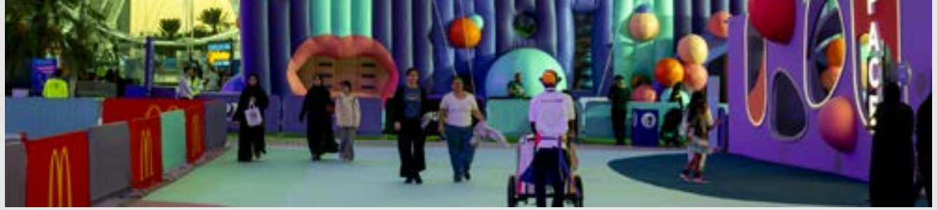
8th MOTN Festival attracted 259,000+ visitors