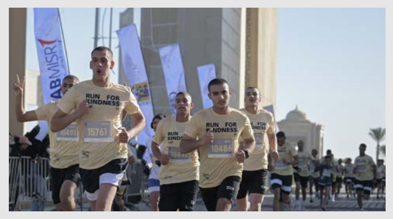
9th Zayed Charity Run attracted 50,000+ participants in support of cancer patients in Egypt

In partnership with Creative Media Authority and Abu Dhabi Film Commission, Apple Original Films movie F1 starring Brad Pitt wrapped production at Formula 1 Etihad Airways Abu Dhabi Grand Prix