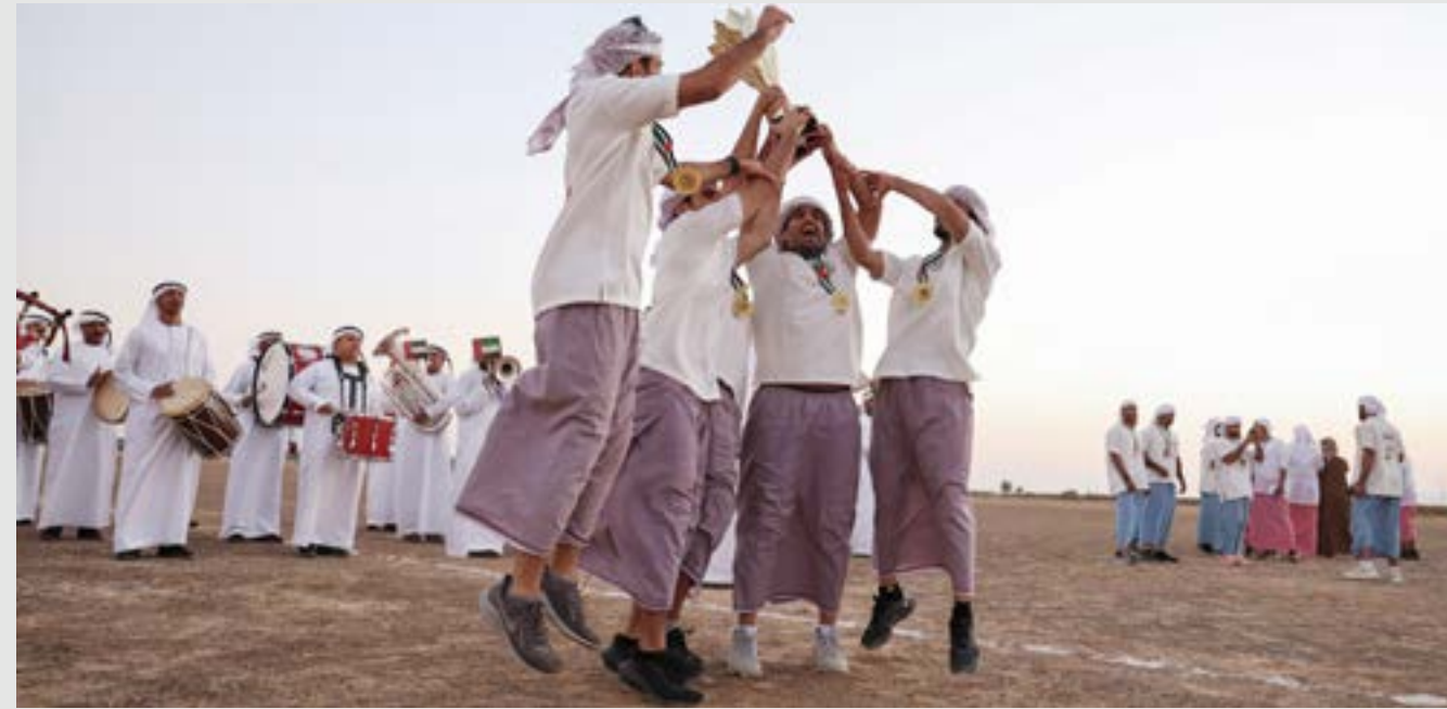
In collaboration with UAE Sports for All Federation, Al Ain Youth Council achieved official recognition of Al Tabbah sport