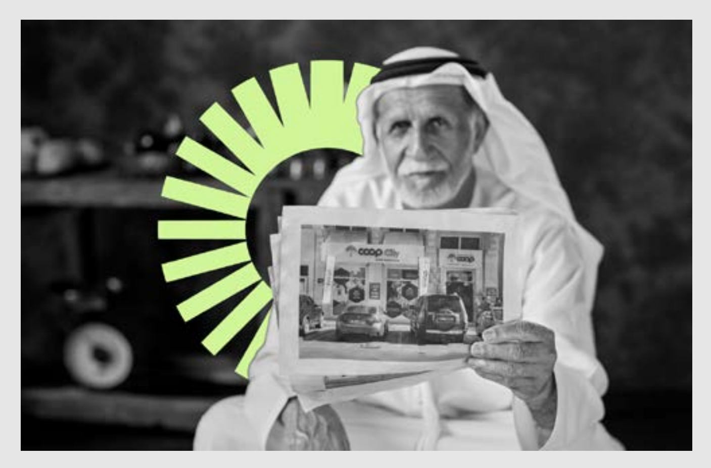
MAIR Group legacy showcased transformation to support key sectors of Abu Dhabi and UAE economy

Al Ain Date Festival highlighted UAE leadership's commitment to celebrate Emirati heritage and strengthen national identity