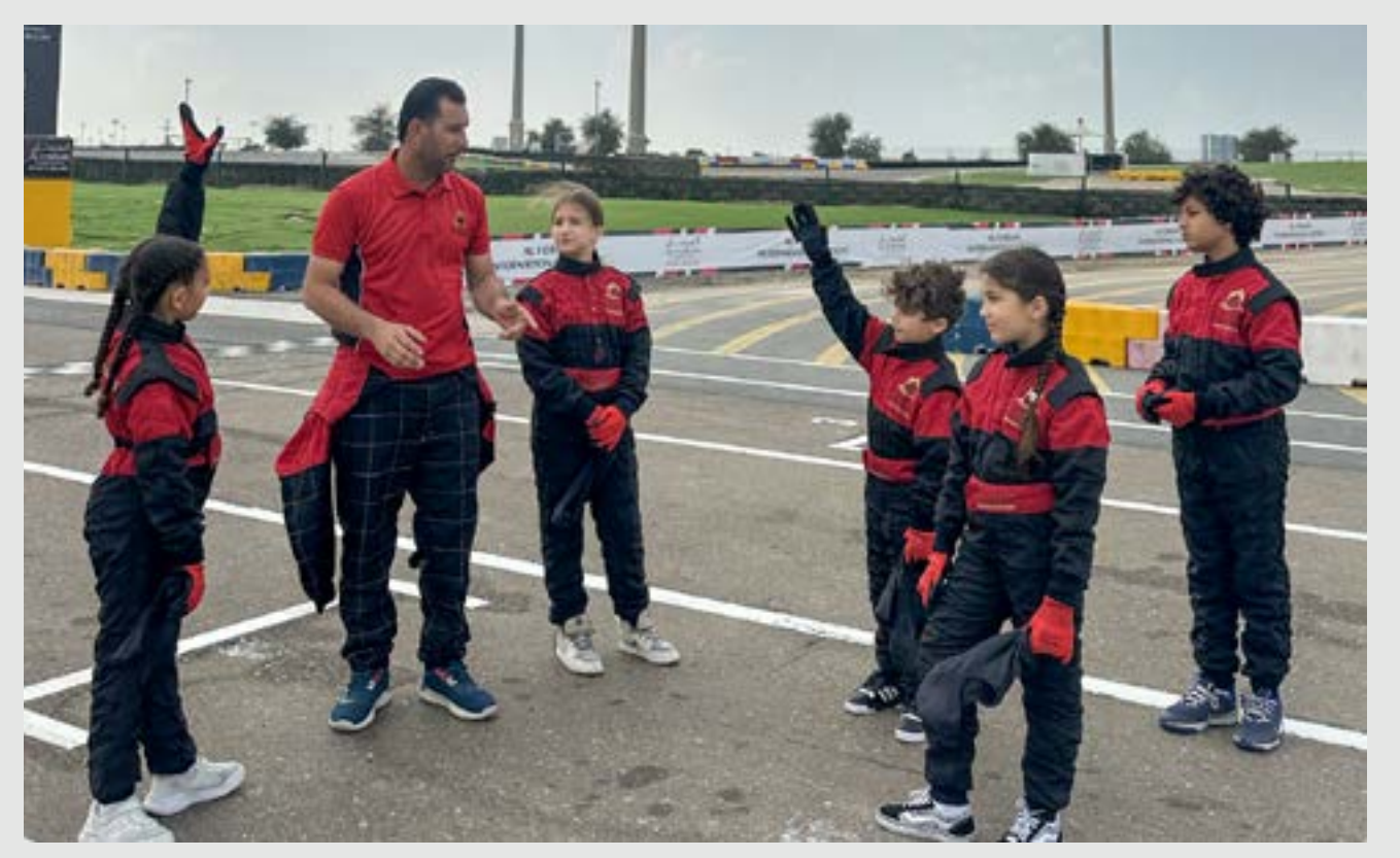
Al Forsan International Sports Resort launched Karting Academy in Abu Dhabi